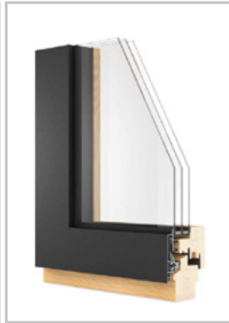
Alto Nova 23 SYSTEM