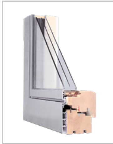
Alto Nova 12 SYSTEM