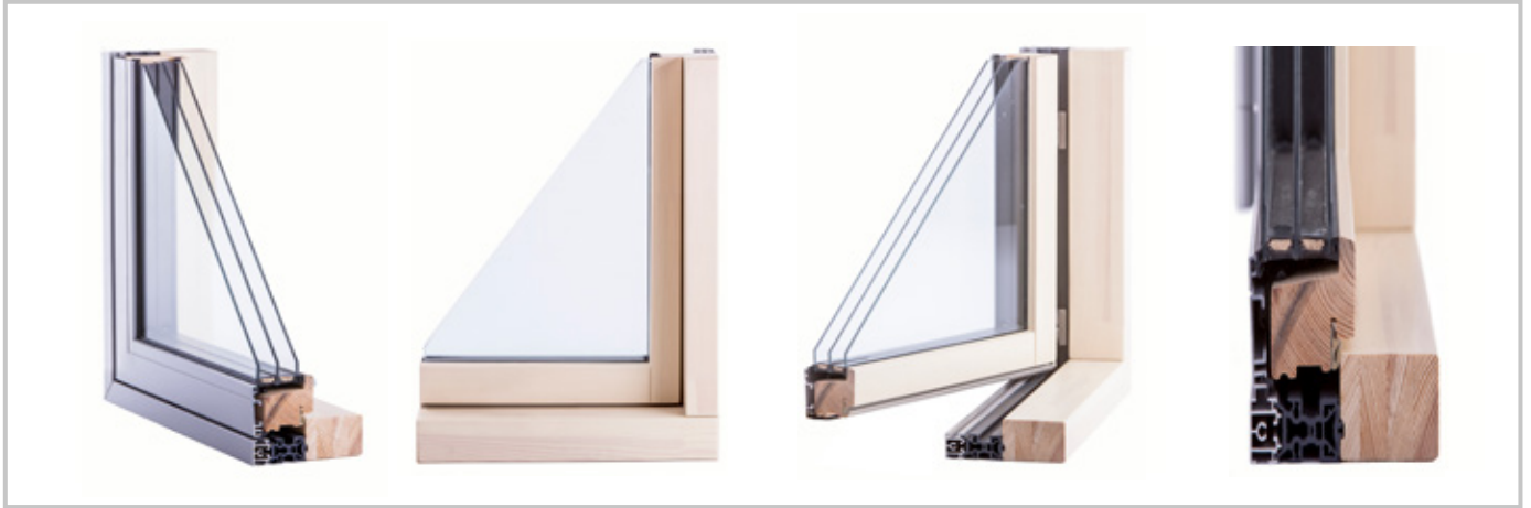
C0to 48 and C0to 62 SYSTEMS