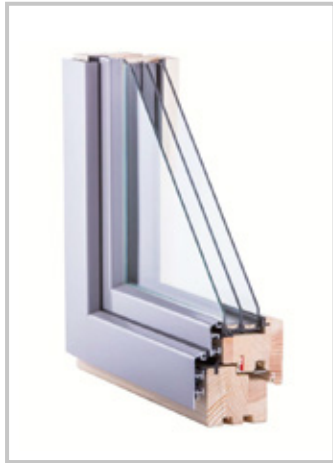
Alto Nova 7 SYSTEM