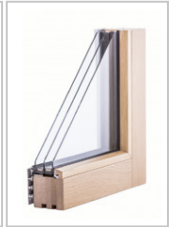
Alto Nova 7 SYSTEM